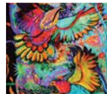
ONE MOONLIT NIGHT